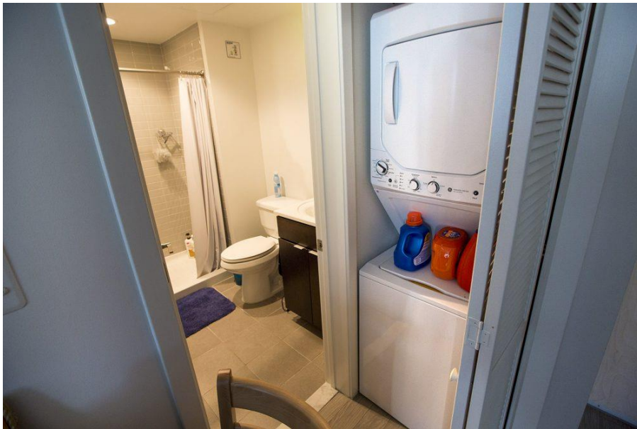
Bathroom and the washer/dryer unit in a small closet